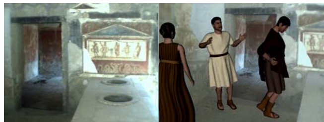
Fig. 1. Example of mixed reality animated characters acting a storytelling drama on the site of ancient Pompeii (view from the mobile AR-life system i-glasses)

experiences through virtual heritage environments. However, taking into its limits current hardware MR enabling technologies as well as virtual human simulation storytelling frameworks, we were able to enhance Presence but not Believability in equal terms (with respect to previous mobile MR experiences), according to qualitative user tests performed during the described demonstrations. In the final section we propose new ways to ameliorate this shortcoming for the next, new generation of believable virtual heritage simulations.