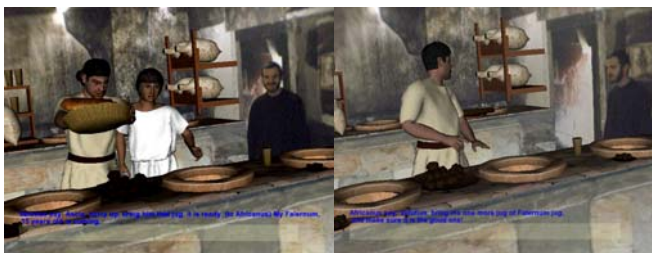
Fig. 3. Further examples of mixed reality animated characters. In this example part of the geometrical structure of the 'thermopolium' is also reconstructed and another example of object manipulation is shown. A real human is also present in this MR scene.

Our belief is that Mobile MR can be a better vision for the future of cultural heritage simulations if the above shortcomings are met so that both notions of believability as well as presence can be reinforced.