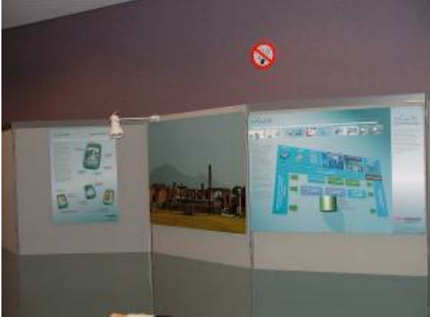
Busy avatar showcase and stand-alone panels