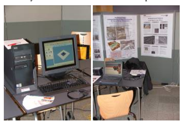
Details of the showcase exhibition at VAST