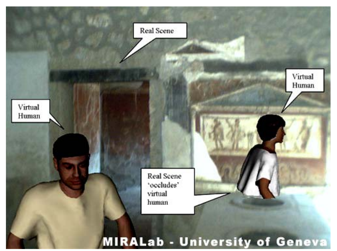
Fig. 2 Real-time virtual Pompeian characters in the real site of the Pompeian thermopolium. Note the use of geometry 'occluders' that allow part of the real scene to occlude part of the virtual human