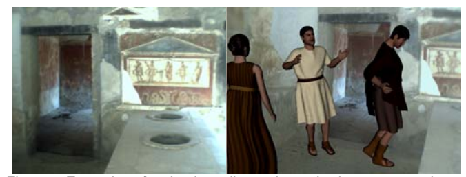
Fig. 1. Example of mixed reality animated characters acting a storytelling drama on the site of ancient Pompeii (view from the mobile AR-life system i-glasses)

experiences through virtual heritage environments. However, taking into its limits current hardware MR enabling technologies as well as virtual human simulation storytelling frameworks, we were able to enhance Presence but not Believability in equal terms (with respect to previous mobile MR experiences), according to qualitative user tests performed during the described demonstrations. In the final section we propose new ways to ameliorate this shortcoming for the next, new generation of believable virtual heritage simulations.