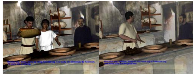
Fig. 3. Further examples of mixed reality animated characters. In this example part of the geometrical structure of the 'thermopolium' is also reconstructed and another example of object manipulation is shown. A real human is also present in this MR scene.

Our belief is that Mobile MR can be a better vision for the future of cultural heritage simulations if the above shortcomings are met so that both notions of believability as well as presence can be reinforced.