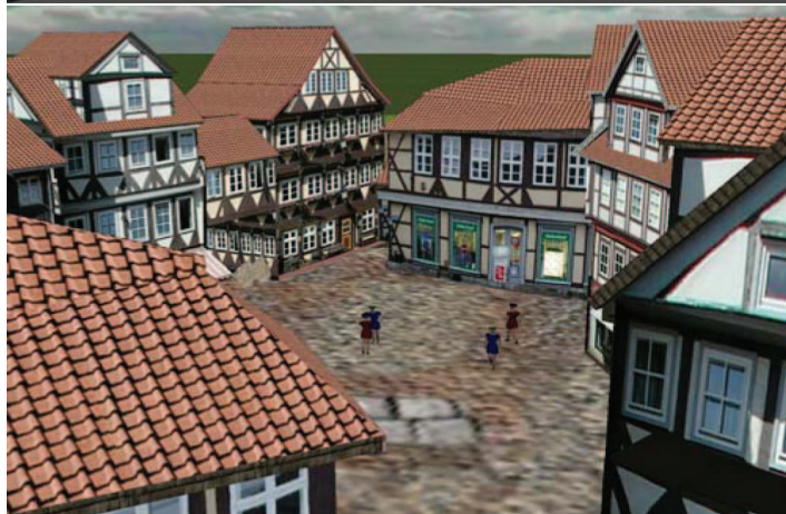
Reconstructions of Medieval Wolfenbüttel in Showcase 4

Avatars are also the core of showcase 6, using interactive storytelling, which allows the visitor to choose from a large