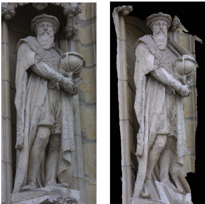
Another application: the statue of Mercator, original (left) and textured model (right)

instance. The ability to turn normal photographs into 3D models literally adds a new dimension. Compared to non-image based techniques there is the important advantage