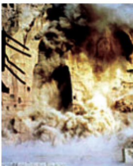
The destruction of the Bamiyan Buddha by Taliban

The Bamiyan Buddha The modeling of the cultural heritage area of Bamiyan, Afghanistan, is a good example showing the capabilities and achievements of the photogrammetric modeling techniques and combining large site landscape modeling with highly detailed modeling of local objects (statues). As it is well known, Afghani Taliban demolished the Buddha statues placed in Bamiyan in March 2001, notwithstanding the appeals from all over the world to save such ancient art masterpieces.