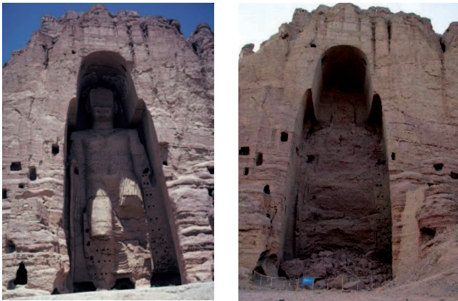
The Bamiyan Buddha before (left) and after (right) the destruction by Taliban

Photogrammetry Since many years photogrammetry has been used quite a lot for mapping, recording and documentation of archaeological monuments,